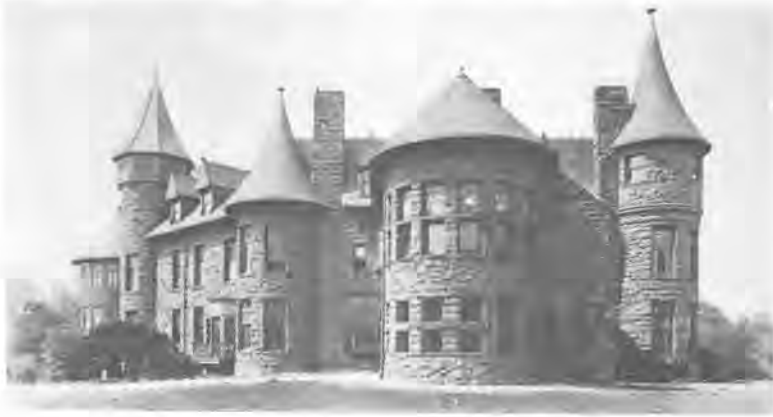
THE OLD CASTLE

On Friday, March 19, 1948, the New Jersey State Board of Education voted to grant status to Fairleigh Dickinson Junior College as a four-year institution with the right to give the Bachelor of Arts degree and the Bachelor of Science degree. It also approved change in the name from Fairleigh Dickinson Junior College to Fairleigh Dickinson College.