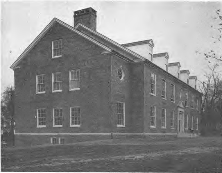
THE NEW BECTON HALL